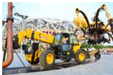
XC6-4517 telescopic handler backing at the 50 anniversary of diplomatic ties between China and France