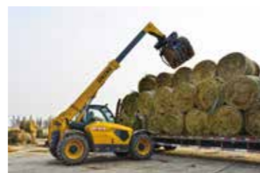
XC6-3007K Holding grass packing