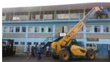
XCMG telescopic handlers help constructions of a factory building in Ethiopia