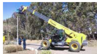
XCMG telescopic handlers help municipal constructions in Africa