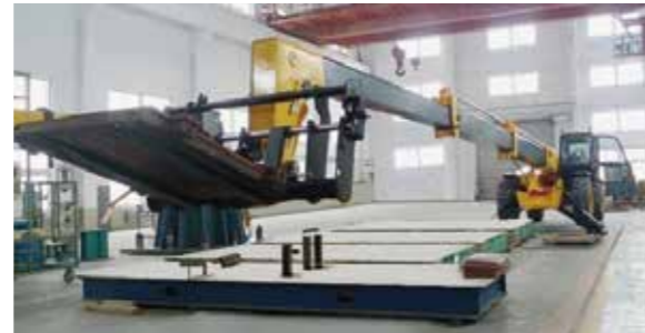
XC6-4517 has passed fatigue load and overload tests of 200,000 times